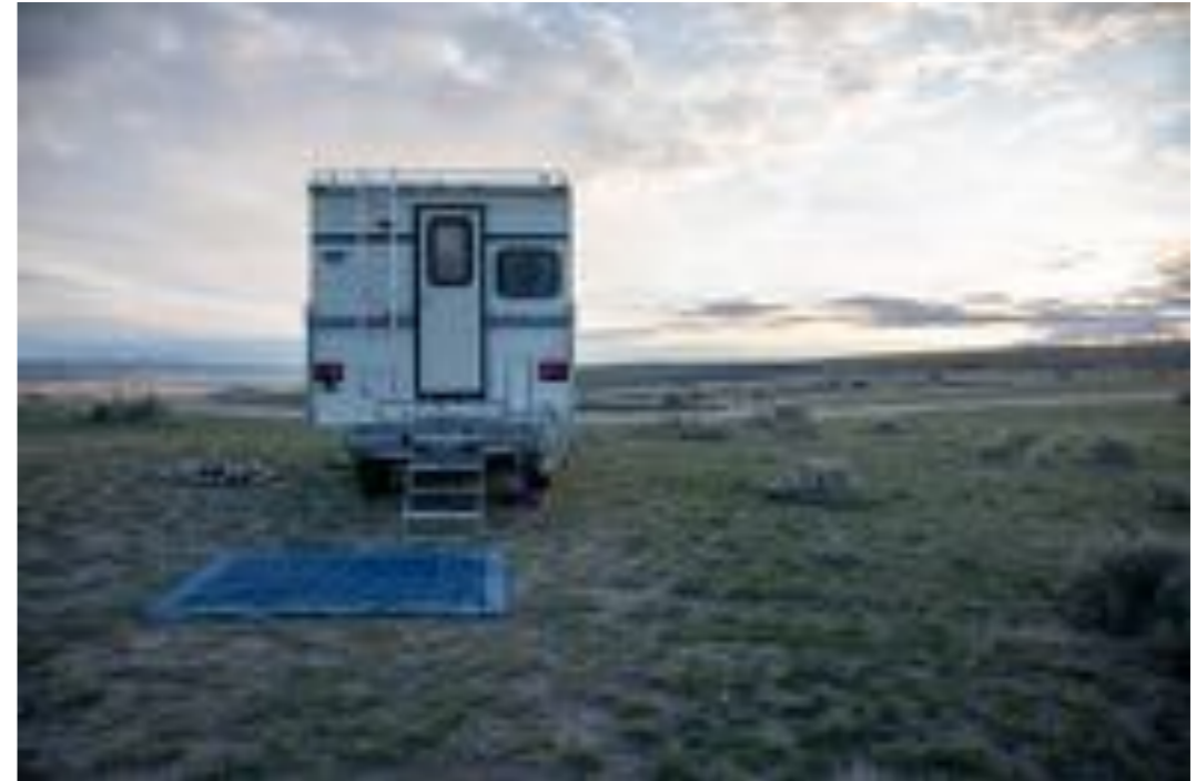
Sunsets in Montana

Thank you for renting the Meadow & Lark. We will agree to a return window at the onset of your rental, but if you will be more than 30 minutes early or late returning the rental please text or call Sarah at 307-699-2608 so that we can be ready for your return.