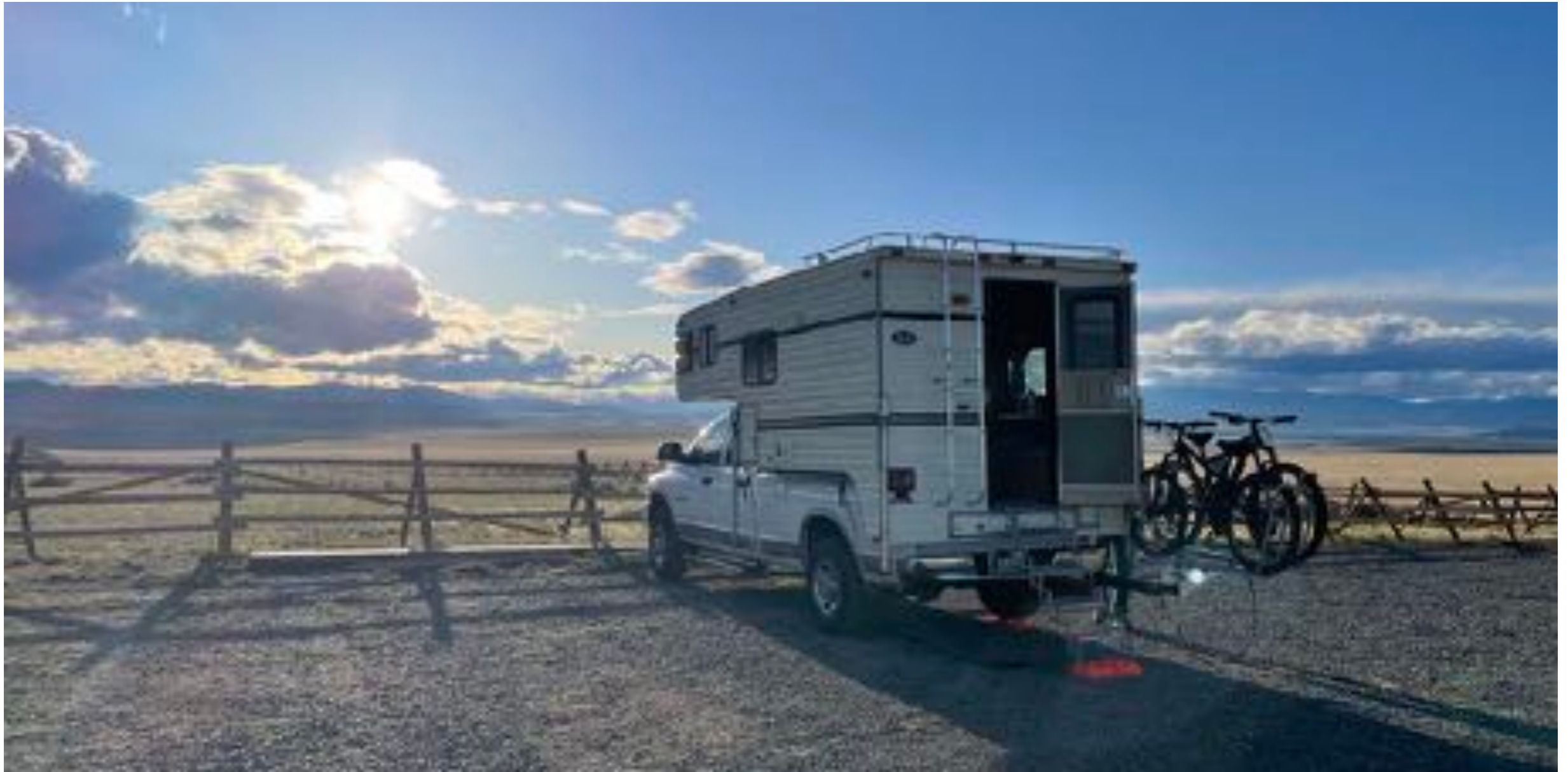
Meadow and Lark at the trailhead at Copper City Mountain Bike Trail System.